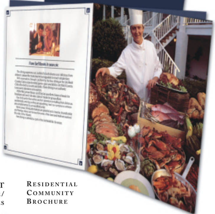
RESIDENTIAL COMMUNITY BROCHURE