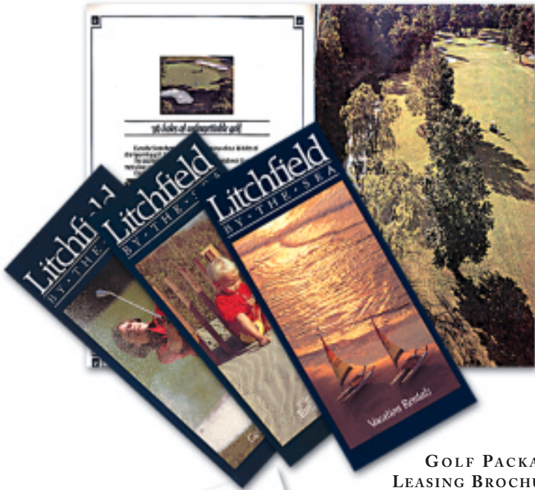
FIT GOLF PACKAGE/ LEASING BROCHURES